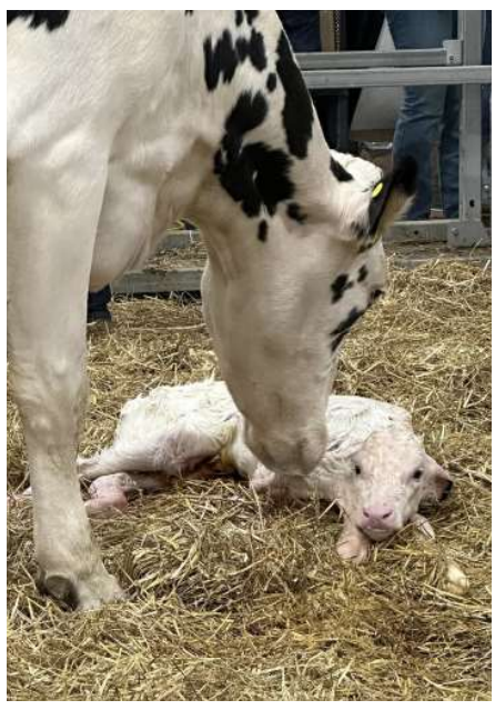
One of the calves that was born on January 6 at the Calving Corner.