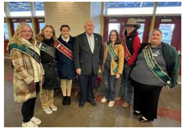
The Royalty Team with Congressman GT Thompson.