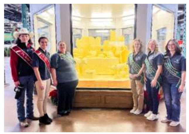
The Royalty Team at the Butter Sculpture.