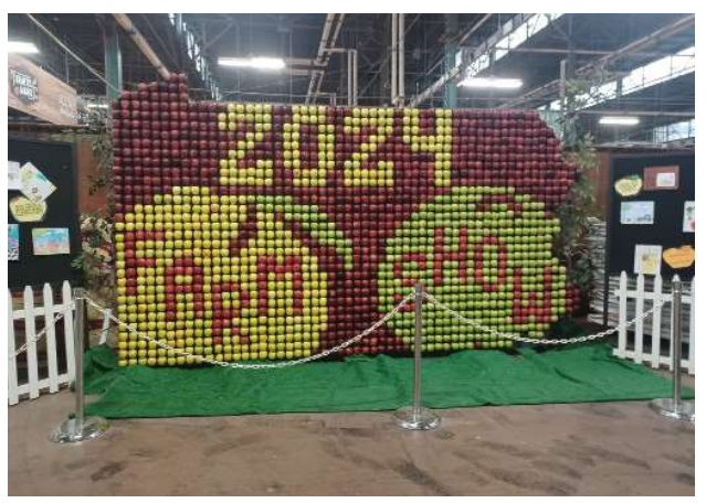
The display for this year's show made out of apples from the Apple Growers Association.