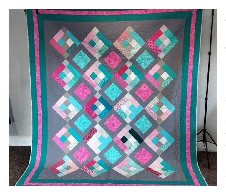
2024 Raffle Quilt

The Family Activities packets will be going out soon. Evelyn and I will be making our way to the State Grange office to get the envelopes stuffed and ready to mail. The 2024 Quilt Raffle tickets will be included in the packets. Please sell the tickets included in your packet and return the stubs and money to Evelyn. If you need more tickets please contact Evelyn.