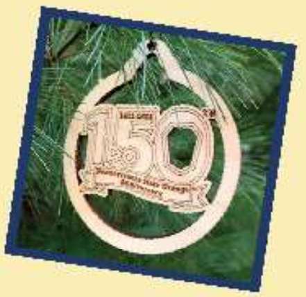
Ornaments - $10 each Set of 4 Ornaments - $35

perfect gifts for special occasions! *while supplies last