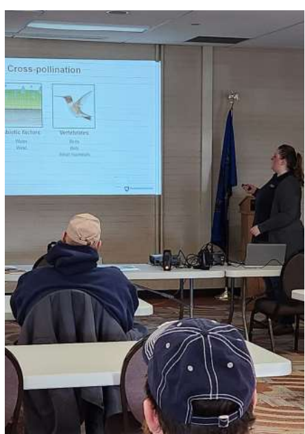
Farmers came out for our first Pesticide Applicators meeting.