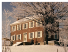
Rhoneymeade Sculpture Garden and Arboretum Leonard Rhone Family Farm