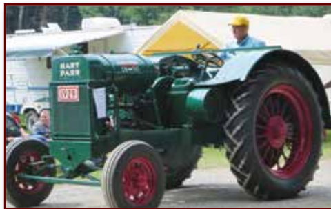
1929 Hart Parr

He decided this was the year for the Sheppard since he had taken other antique tractors pre-