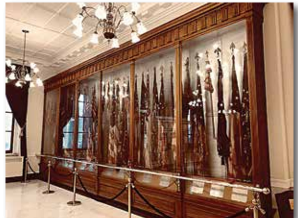
Civil War Flags on display in the lobby of the New Hampshire State Capitol

New Hampshire has 400 legislators. Sad shared details of what it means to be a legislator in New Hampshire. "The New Hampshire