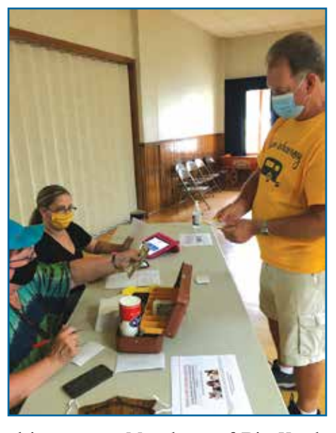
this year so Members of Big Knob Grange had a "Take Out Stuffed