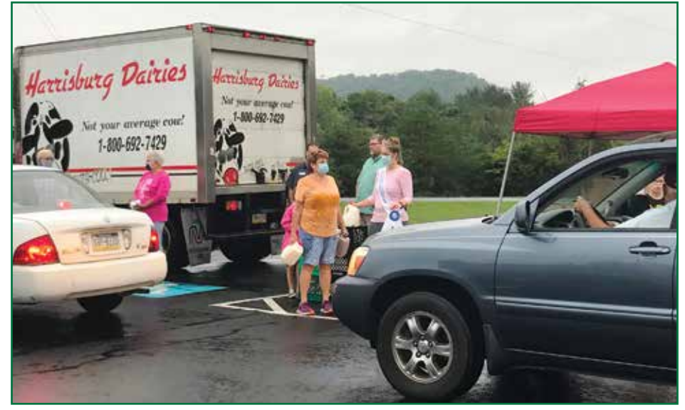
(Perry Valley Grange members pictured during a Grange sponsored drive-through milk qiveaway)

Three local volunteer fire companies in southern Lycoming County - Montgomery, Clinton Township and Washington Township - each recently received a $500 grant and framed certificate of appreciation from Eagle Grange #1, Montgomery, PA. The County Director of Emergency Services spoke during the program and two of the three County Commissioners attended the meeting. Each of these officials added their thanks for the extraordinary contributions given to the community by these volunteer emergency services and commended the Grange for making the generous gifts to support the fire companies.