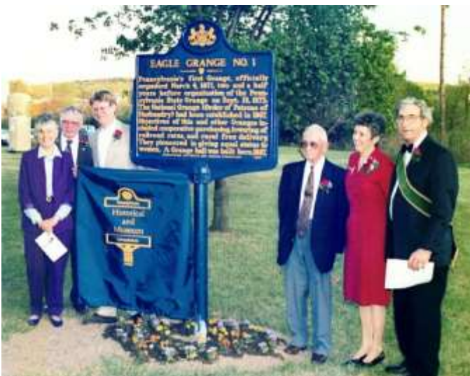
2001 Historical Marker Dedication