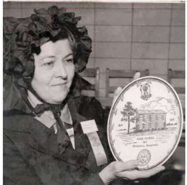
1971 Centennial Plate