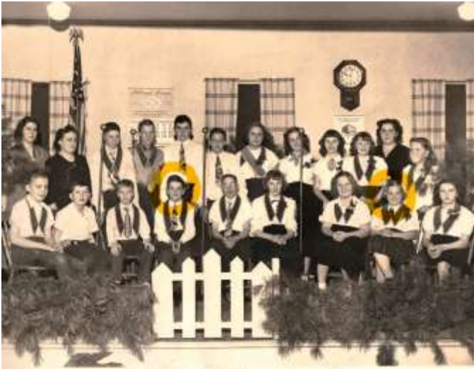
1945 Junior Grange (above) and 1959 Junior Grange (below); Recognize those circled in yellow?

See more scenes from the past in slide program later this year