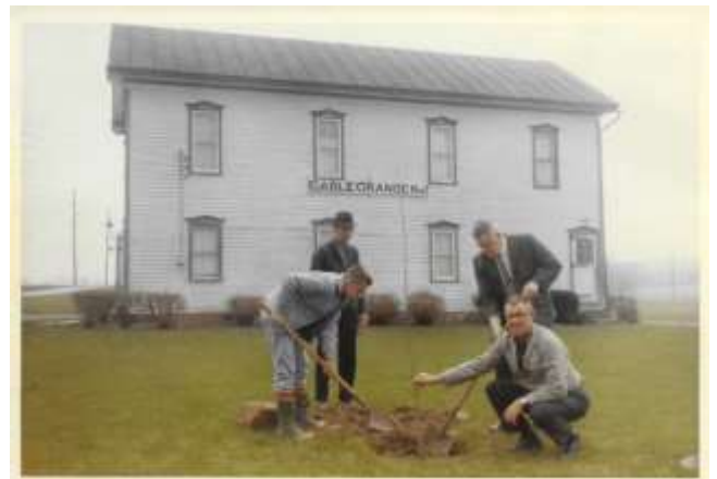
1967 Tree Planting