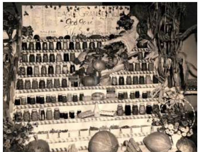
Fair Exhibit – year unknown