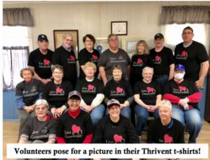
Volunteers pose for a picture in their Thrivent t-shirts!