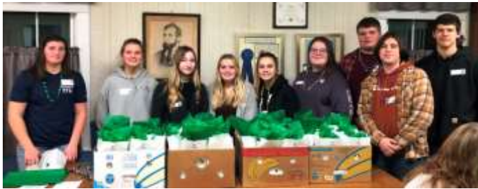
Volunteers (above) from the Montgomery FFA Chapter came to the March 1 st meeting & helped pack the gift bags with the items shown below.