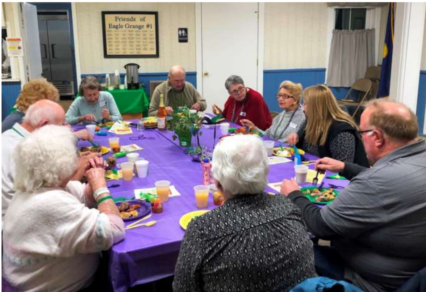
Tables decorated in the three traditional Mardi Gras colors (gold, purple and green) were the perfect setting for the Sausage & Pancake Supper. Bacon, scrapple, fruit, juice & coffee was also served.