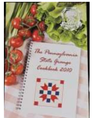
2010 Edition – Discounted to $15