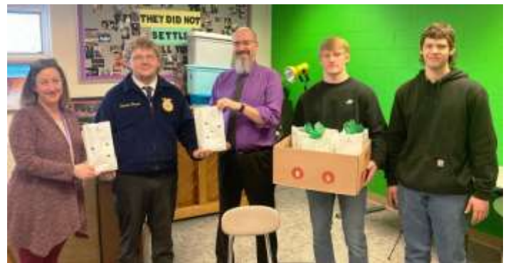
(Above) FFA members delivered the token of thanks to some 140 teachers, administrators & support staff in Montgomery School District.