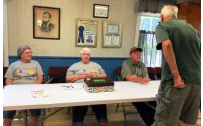
Guests are greeted as they arrive for their ham dinners.