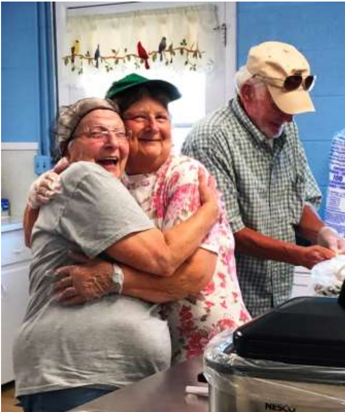
Looks like the volunteers are having a good time!