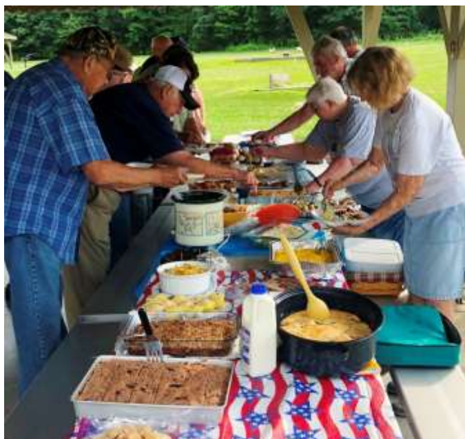
Yum, yum! No shortage of food on the buffet line!