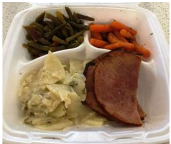
Each meal included these hot items, applesauce, Oriental salad, roll & butter and marble cake for dessert.