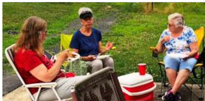
Friends enjoyed fellowship while eating (above; below)