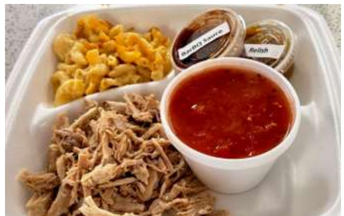
Pulled pork, macaroni & cheese, fresh stewed tomatoes and homemade relish & barbeque sauce were just part of each meal. A bag with berry cobbler, pepper cabbage, applesauce and roll/butter was also included.