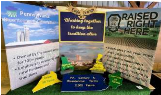
With some modifications, the display will also be going to the Sullivan County Fair in early September and the Bloomsburg Fair at the end of that month to help educate fair goers about the importance of family farms in feeding America.