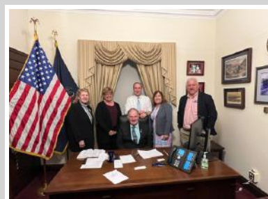
A visit to Congressman John Joyce office in Washington DC. at the Legislative Fly-In.