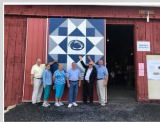
AG Progress Days highlighting the new PSU Quilt Block.