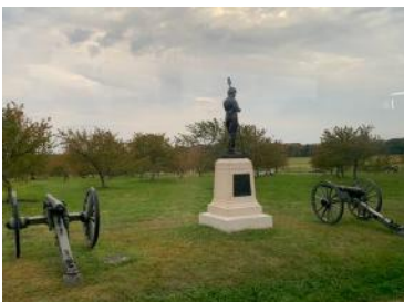
We have a scenic drive through the Gettysburg Battlefield on our way to dinner at The Lodges of Gettysburg.