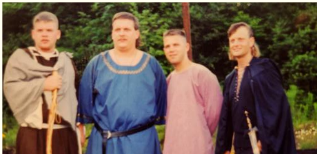
Medieval themed Youth Camp, where I learned "There's no friend like a Grange friend".

attend Young Adults Conference in Lancaster in March, which I did. I was welcomed in immediately, and was affectionately called 'The New Guy'. Decades later, they still call me 'New Guy', and the brothers and sisters I met that day remain some of my closest friends.