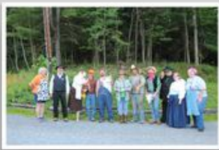
Wayne, Grange Directors and volunteers dressed for the Wild Wild West theme.