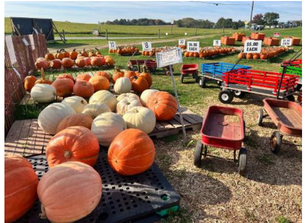
Pumpkins at Smyser's Farm.