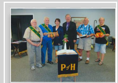
A visit to Somerset County to meet with Grange leaders.