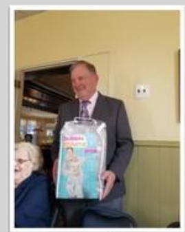
Lehighton Pomoma Grange members presented Wayne with a bubble suit after he had fallen through the floor of a very old Grange hall.