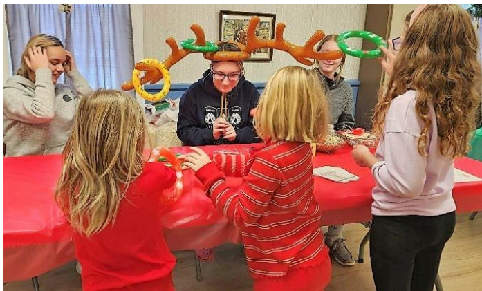
Reindeer Antler Ring Toss Game of Skill