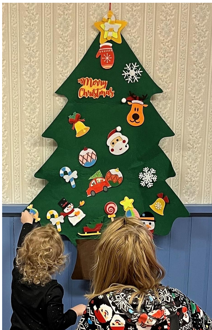
Adding Decorations to the Wall Tree