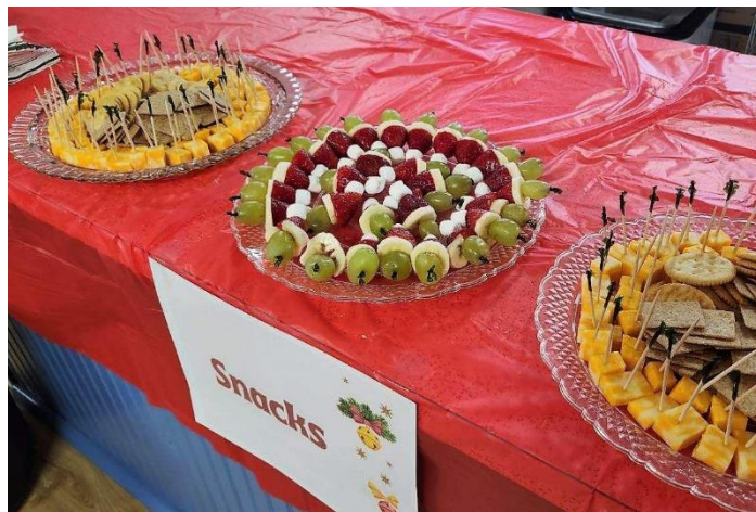
Colorful Holiday Snacks Served