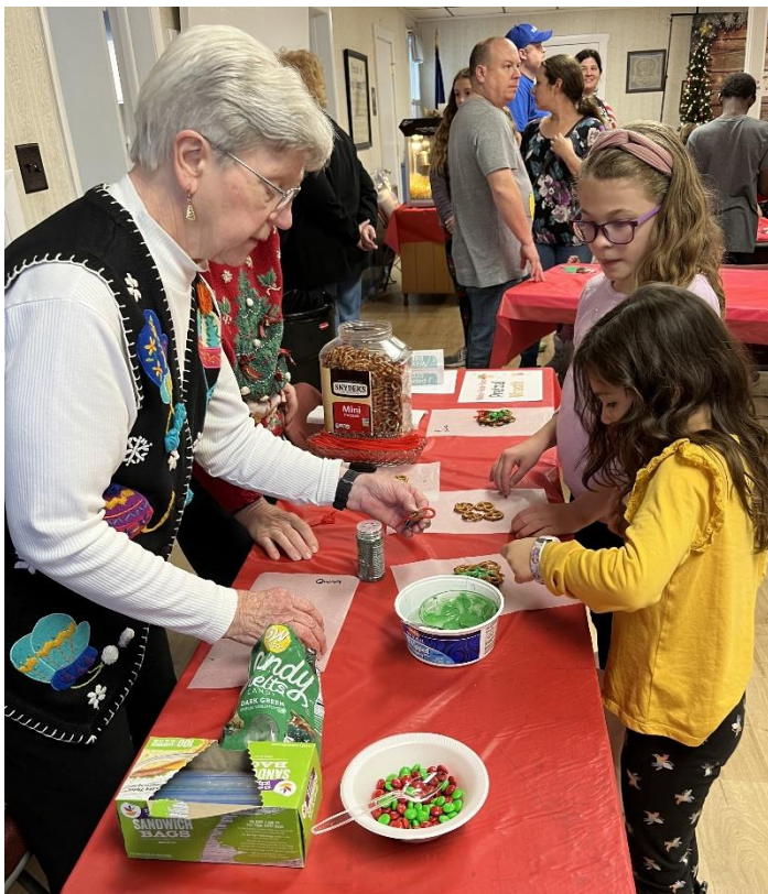
Ever Hear of Making a Pretzel Wreath?