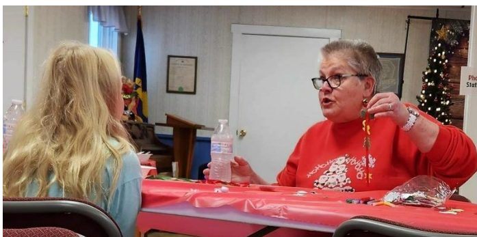
Making a Tree Ornament to Take Home