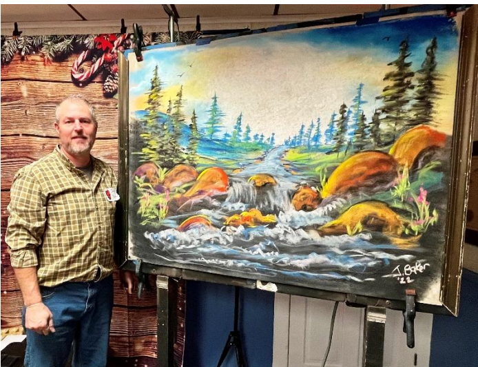
The finished picture was gifted to the Grange.