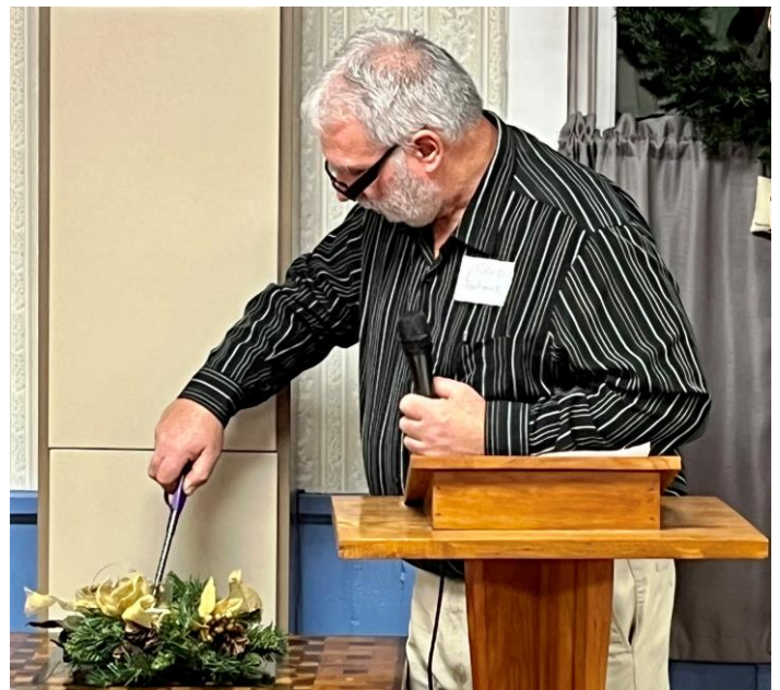
The State Grange 150 th anniversary candle is lit and a reading is given at each meeting during the year.