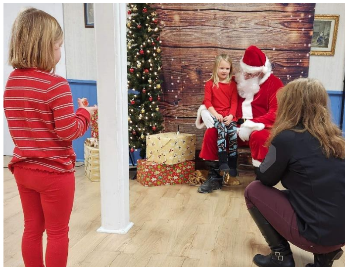
Young (& some older, too) Enjoyed a Visit with Santa