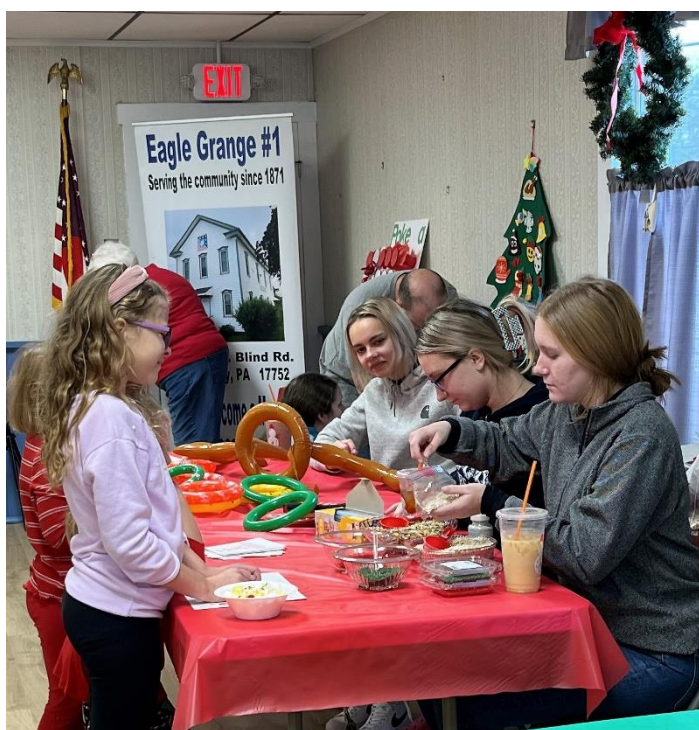
FFA Students Lead Craft Station