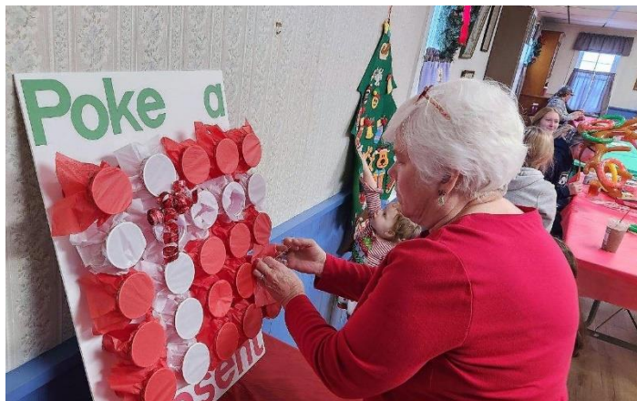
Try Your Skill at Getting a Present

A new and very popular service project sponsored by Eagle Grange