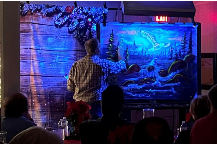
The lights are dimmed to reveal new features in the artwork, including an eagle soaring over the landscape.