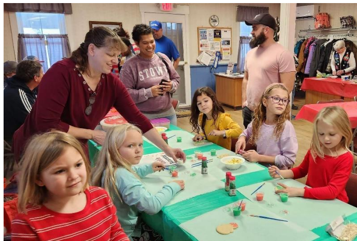
Cookie Decorating Fun