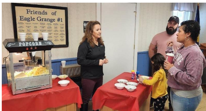
Popcorn Provided by Thrivent Financial