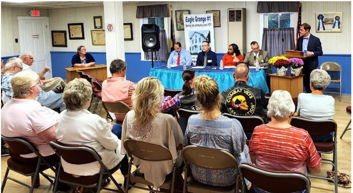
An audience of about 40 persons listened intently as the four candidates answered questions and later enjoyed refreshments with more conversations.