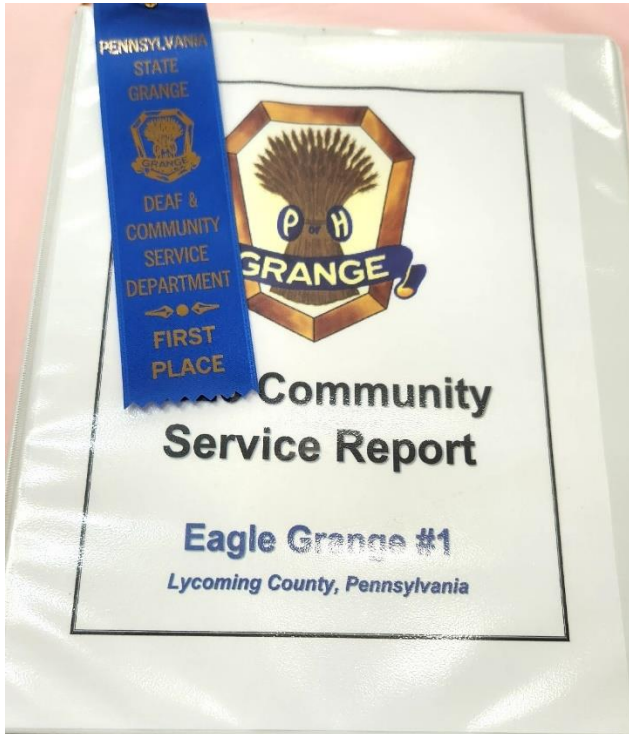
Our first place Community Service Report for Granges with 26-50 members received a prize of $150.