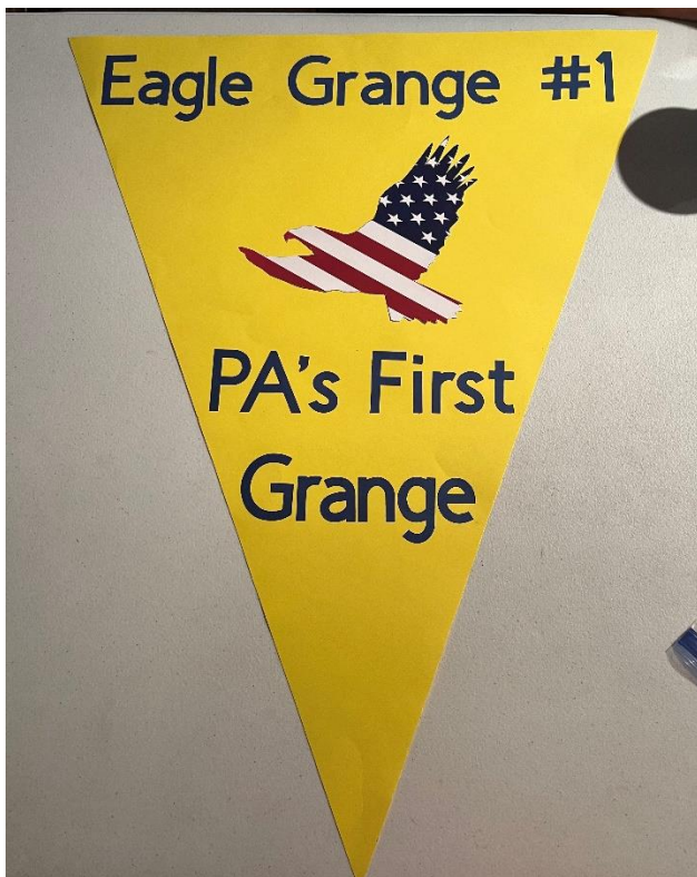
This pennant was prominently displayed with 50 or so others representing Subordinate, Junior and Pomona Granges from around the state.