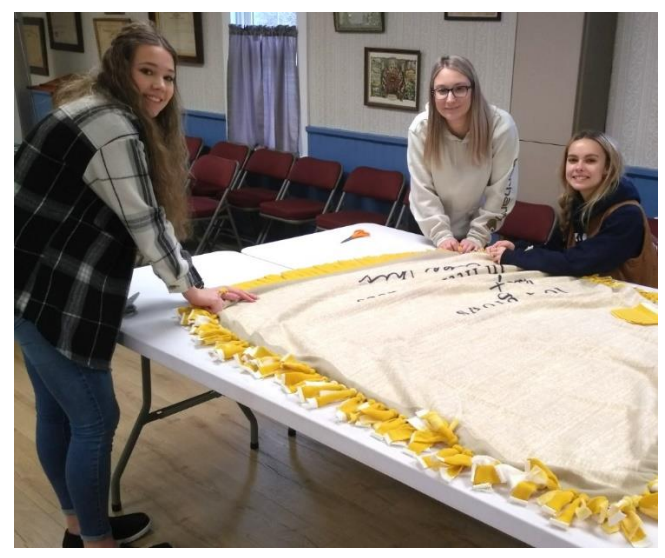
Three Montgomery FFA students also came by to help.