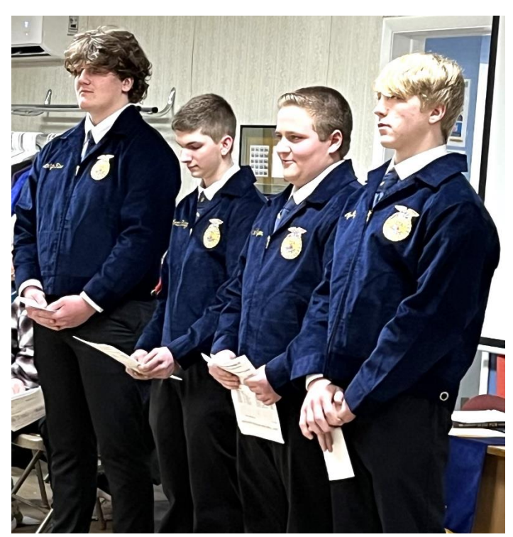
These four young men received their Blue Jackets at the PA Farm Show as they begin their FFA journey. Eagle Grange sponsored three of the jackets and was eager to hear each of them speak about their FFA involvement.