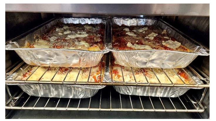
By 10 a.m. the first lasagna were baking in the oven.