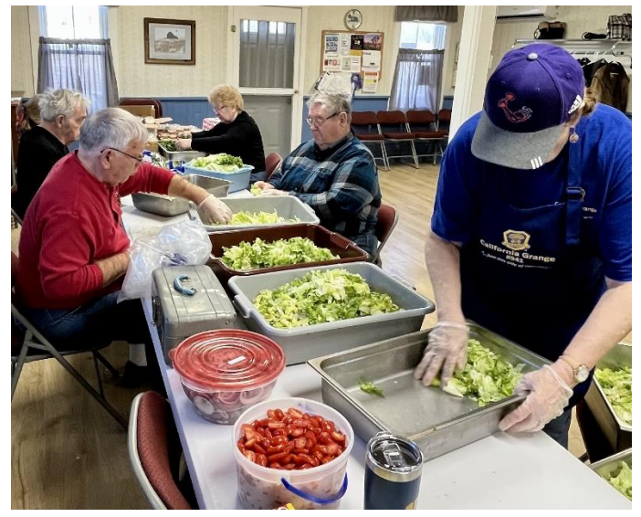
Assembly line of volunteers preparing tubs of salad