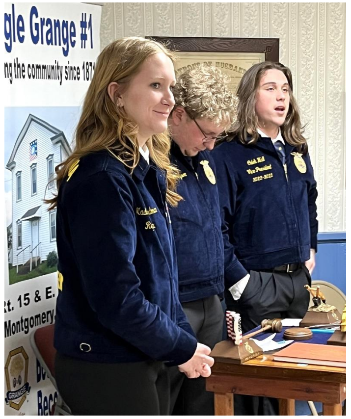
FFA officers (above & below) led a very well done and impressive demonstration of their meeting procedures. There were many similarities to the opening and closing ritual practiced by the Grange.