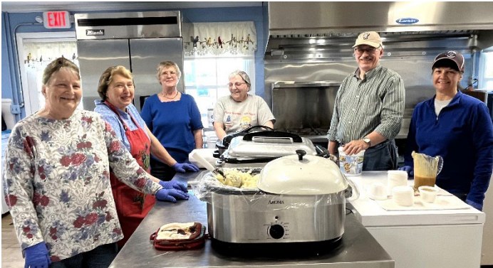
Looks like the kitchen crew is ready and waiting to start serving.

About 140 meals were served at the May 6 th Roast Beef Dinner. There was a great turn-out of volunteers and the Grange realize a profit of almost $1,800.