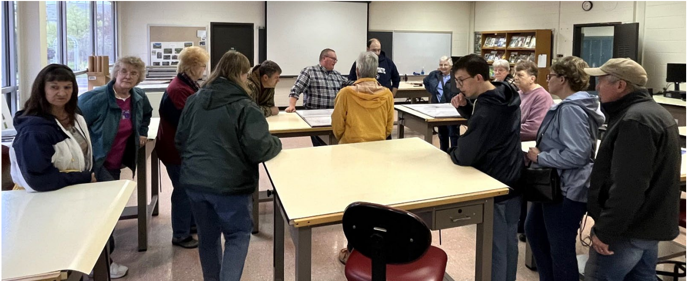
A group of 18 Grange members and friends journeyed to the nearby Schneebeli Earth Science Center for a tour of their facilities for the program at the May meeting. The Science Center is part of the PA College of Technology. Afterward, the group returned to the Grange Hall for an informal meeting and refreshments.