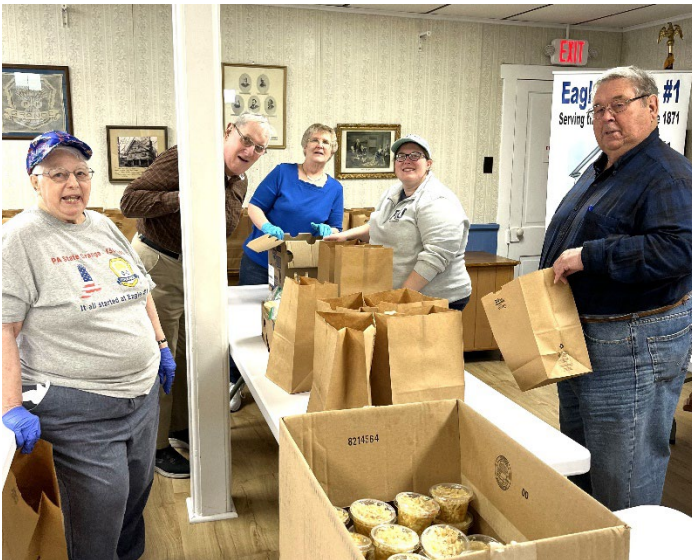
It takes many hands to pack the meal fixings into individual containers and bags.