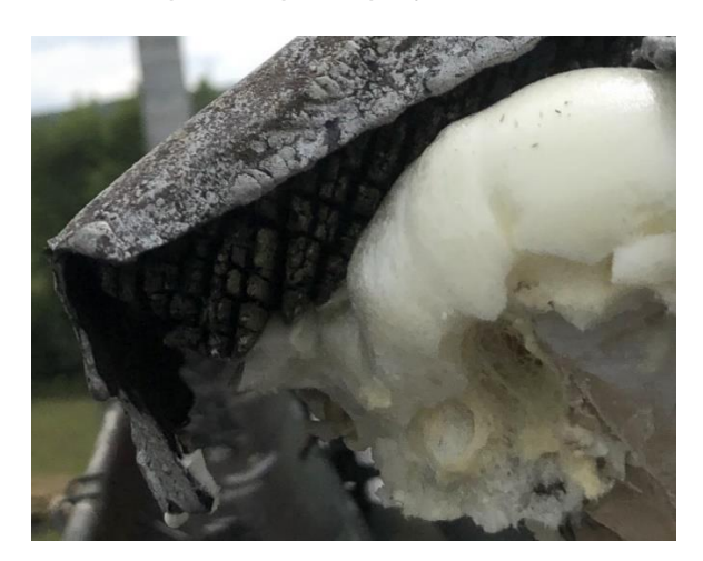
Now there's no evidence of the bird damage

• We're still doing battle with the birds! A hole in the wooden roof soffit on the front left of the hall provided a handy nesting site for a family of starlings but they have now been evicted. The hole was filled with an expandable foam and the soffit repaired/replaced (below) by Earl Neff, a contractor from Montoursville who also did much of the finish work on the new countertop/backsplash project.