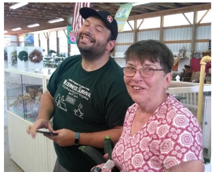
Wonder if these two will be adorned in grass skirts for the luau next month???