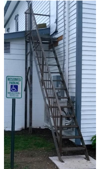
Photo (above right) – The fire escape has already been stripped, re-attached to the building, the damaged siding replaced and, for the first time, is now securely anchored with a concrete pad. Painting is next!

hardware/closers on two existing metal doors. Written bids from three companies were considered during a short business meeting at the July picnic and the project awarded to Amos King Electrical & Plumbing of Montgomery for a total cost of $8,766. One of the other bids did not include any work on the fire escape and the third bid was several times higher than the one accepted.