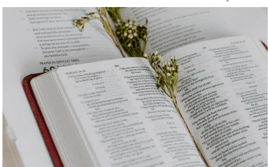
Read Bible Verses: Lamentations 3: 22-23 and Jeremiah 29:11