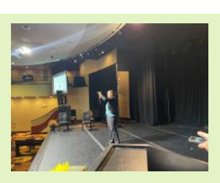
Jodi Kinsinger competed in the Sign-A-Song Contest.