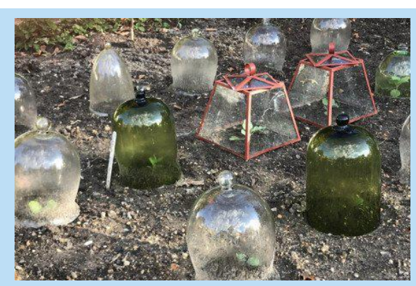
Cloches protect vegetables planted in early spring.

when Swiss chard, members of the cabbage family—cabbage, broccoli, kale, etc.—and several herbs can be started indoors in early March. Tomatoes, peppers, and warm weather plants that are set out after Mother's Day should be started indoors in early April.