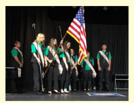
Youth Officer Team presenting the flag