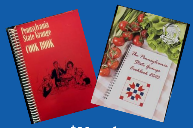
$30 each Order Cookbooks at: www.pagrange.org