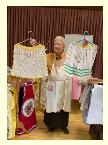
Two beautiful examples of handcrafted crocheted aprons.