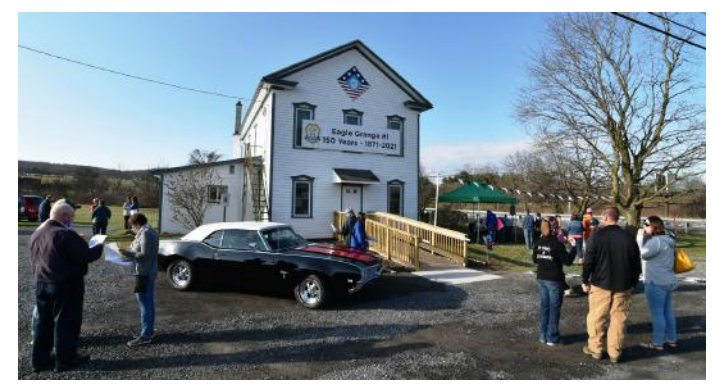
Road Rally participants gathered near this vintage car parked outside the Eagle Grange Hall, in Montgomery, Lycoming County, early on the morning of Saturday, March 27th to register for a mobile family-friendly scavenger hunt. The rally was sponsored as a community service by Eagle Grange #1 which is observing its 150th anniversary in 2021

around 80 miles in length and took teams around 3.5 hours to complete. Teams were given clues that they opened when they arrived at each stop. Once solved, the clues directed the teams to do a specific task at each stop, including posing for certain pictures or certain items to purchase at a business. Teams were provided a list of stops, but each team was responsible for developing their own route. Additionally, teams were provided a list of "bonus items", which included places and things