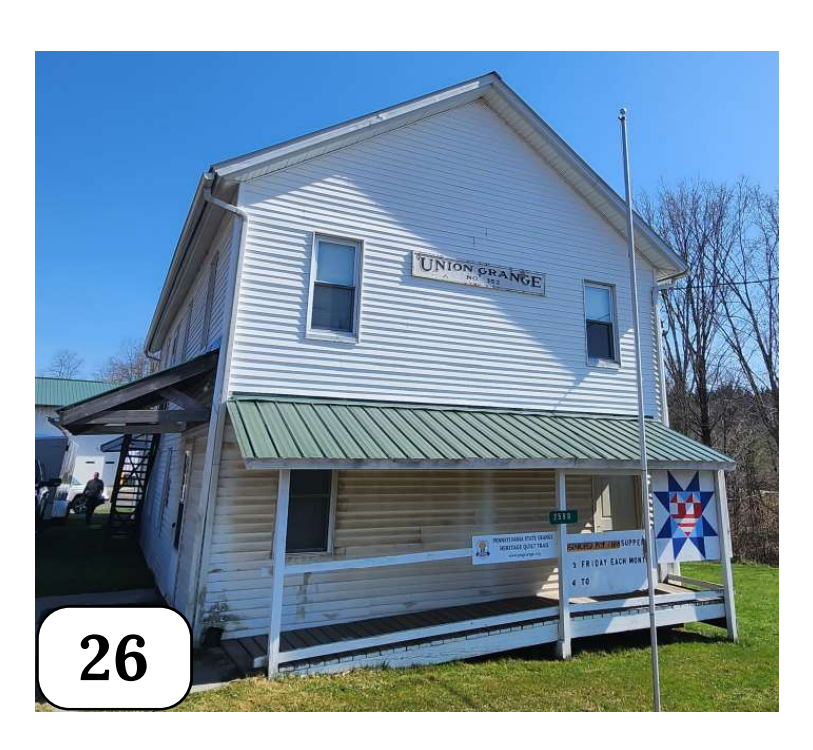
Subordinate Spotlight: Union Grange #152